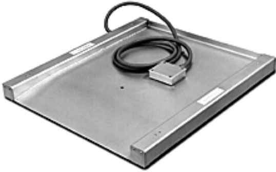
Model SBW-SS-R1 Barrel Weigher Stainless Steel, One Ramp Model