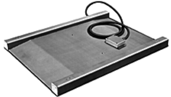
Model SBW-SS-R2 Barrel Weigher Stainless Steel, Two Ramp Model