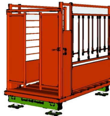
Cattle Chute Scale

Load Cell Central follows a policy of continuous improvement and reserves the right to change specifications without notice. © 2010